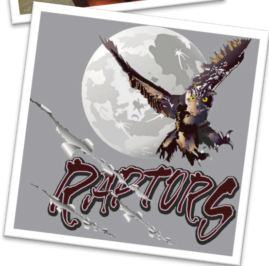
Silver Creek High School Mascot