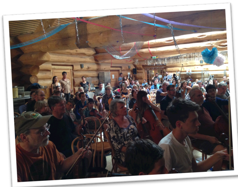
The entire ensemble of campers the day of the concert (above)