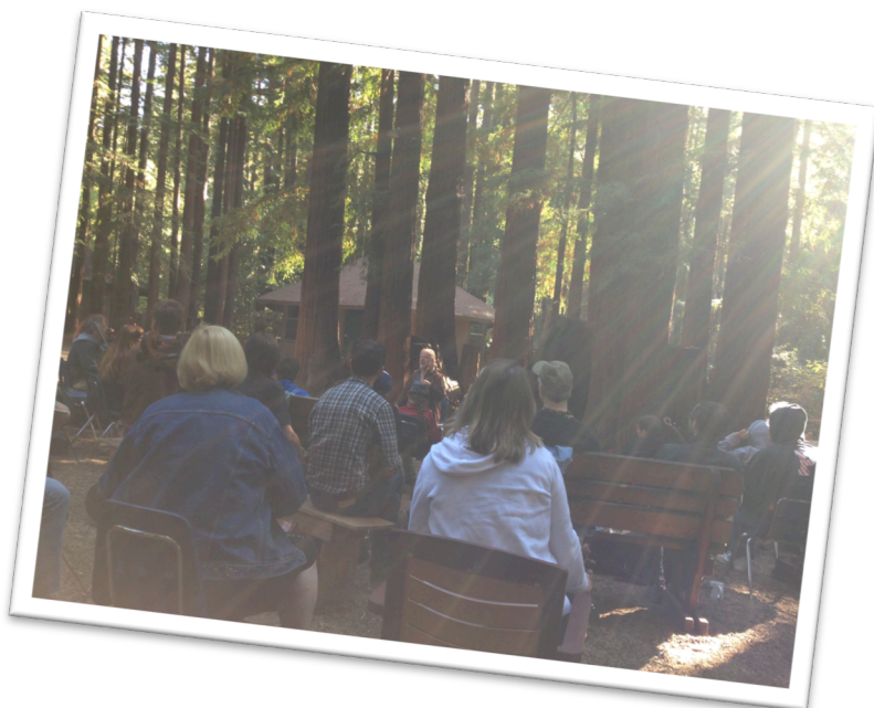
Our "Classroom" at Valley of the Moon Scottish Fiddle School in beautiful Camp Campbell