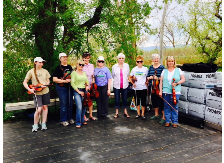
Fiddle Club plays for opening of Shortgrass Greenhouse season, May 3rd. Thanks to all who played!